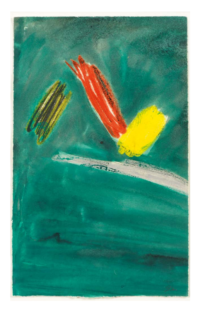
QUARTO (1977) initialled; signed, titled and dated on backboard watercolour and oil pastel on paper 14.5 x 8.5 cm

MANNAKIN (1979) initialled; signed, titled and dated on backboard gouache and oil pastel on paper 23.5 x 15 cm