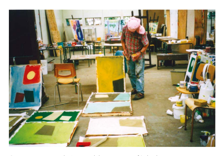
Guest artist at Emma Lake Artist Workshop, University of Saskatchewan, 2000